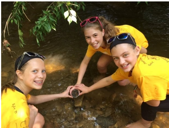
TIC students.