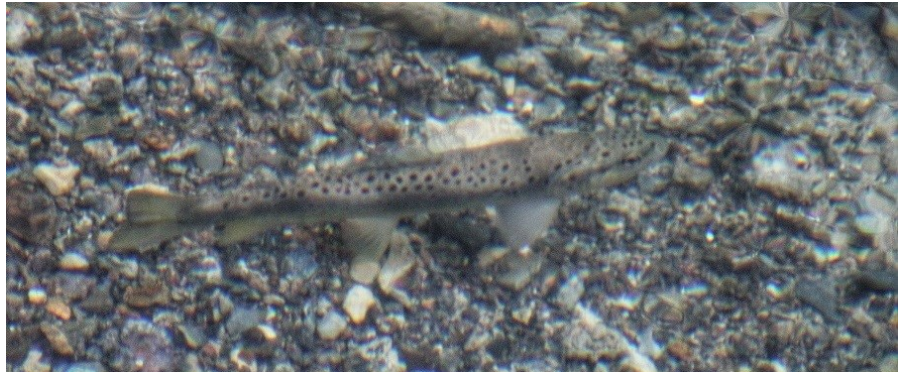
Spawning Trout in Letort