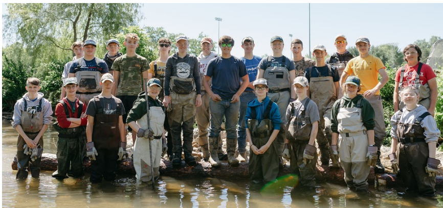
Rivers Conservation and Fly Fishing Youth Camp Members Complete the Habitat Project.