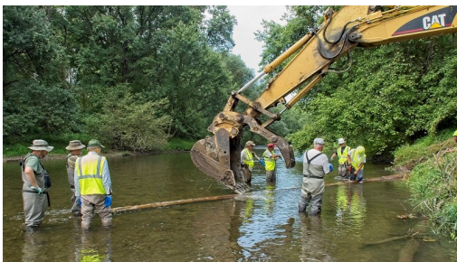
Wittlinger Project.