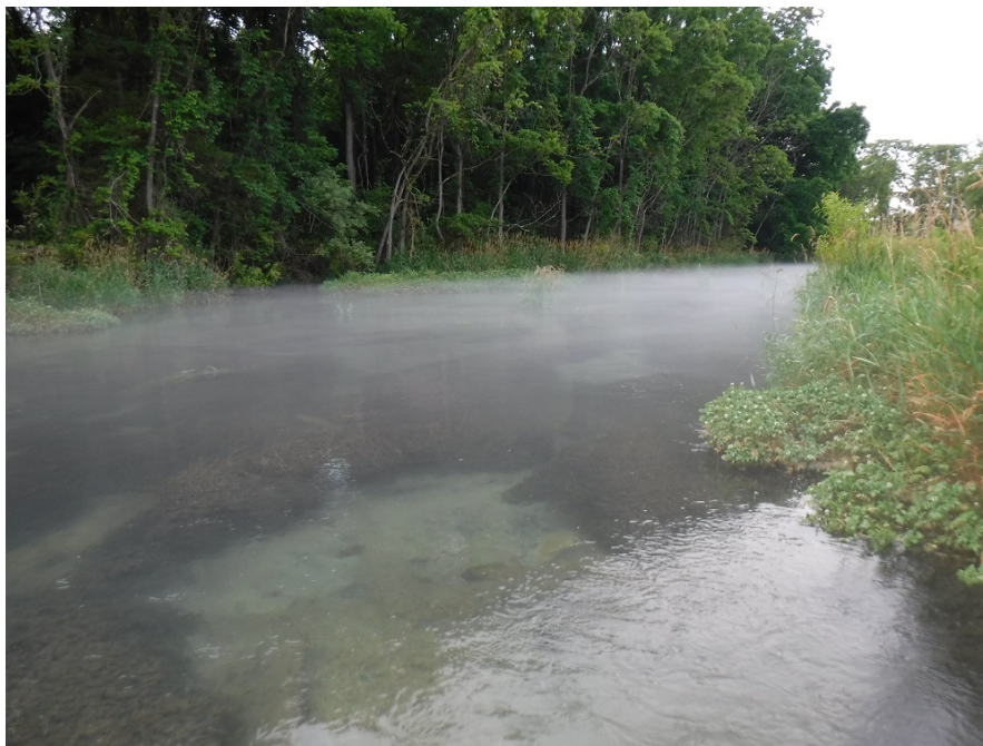
Big Spring Phase 2 Section, Summer 2019