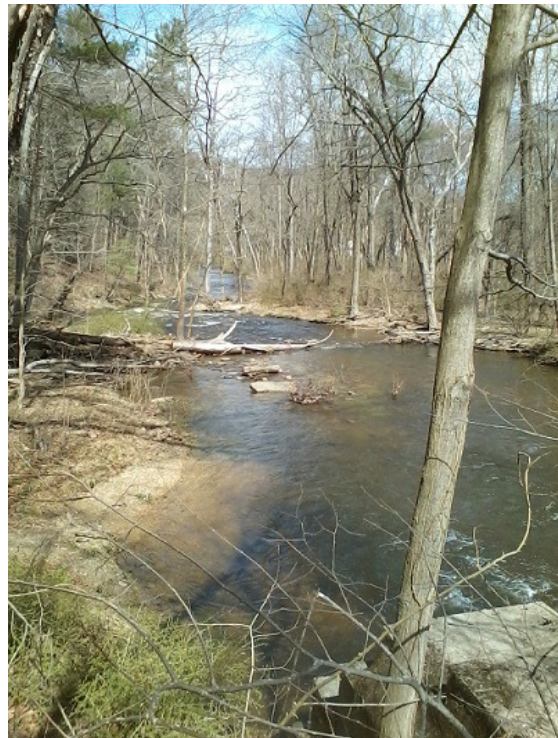
Mountain Creek, Photo Courtesy: D. Weaver

We are also looking for gillies for the 10 fishing sessions for the camp. Evening fishing begins at 6PM and ends at dark. Morning sessions begin at 5:30 AM and end at 8:00 AM. Volunteer gillies wear their own vest and carry their own favorite flies to insure they have everything to make the session a successful one for the student. We do ask that gillies NOT carry a rod. Working with these young people is a rewarding and memorable time. We hope you will join us as often as your schedule permits. To sign-up for any or all fishing sessions, contact Biff Healy by email at biffer1966@hotmail.com , or call him at 717-254-7386.