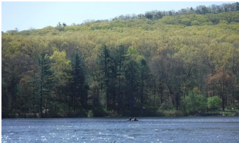
Laurel Lake, April 2019