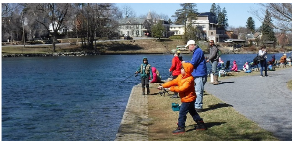
Mentored Youth Day, 2019