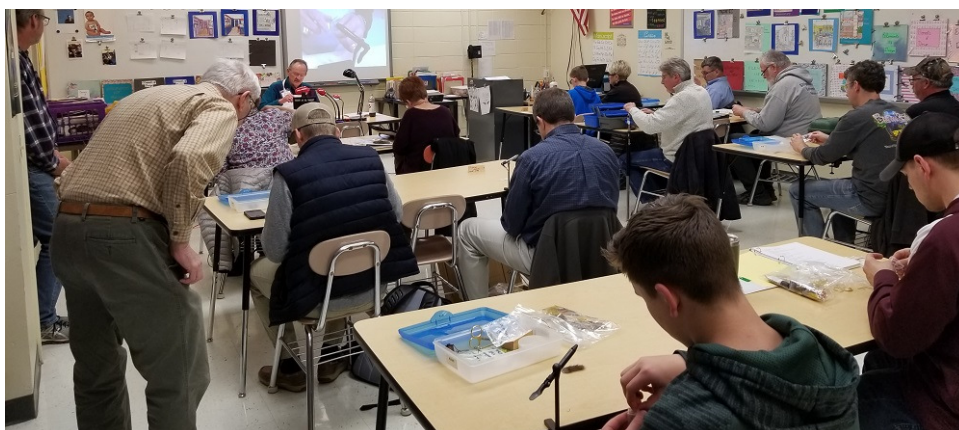
Winter Fly Tying Class, 2019