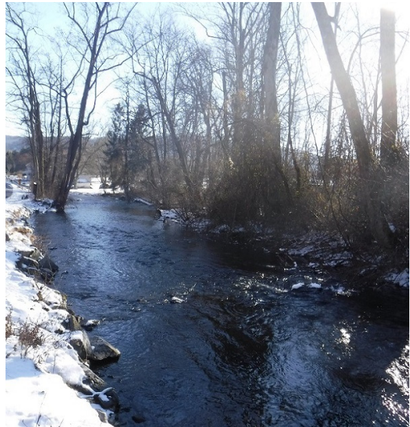
Yellow Breeches.

Make checks payable to South Middleton Twp. Parks and Rec.; 20 % discount for twp. resident senior citizen; register through twp. website.