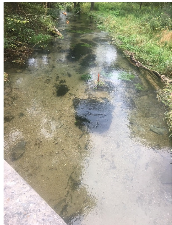
Looking upstream off the Bonney Brook Bridge into Trego's Meadow after channel clearing and grass removal.