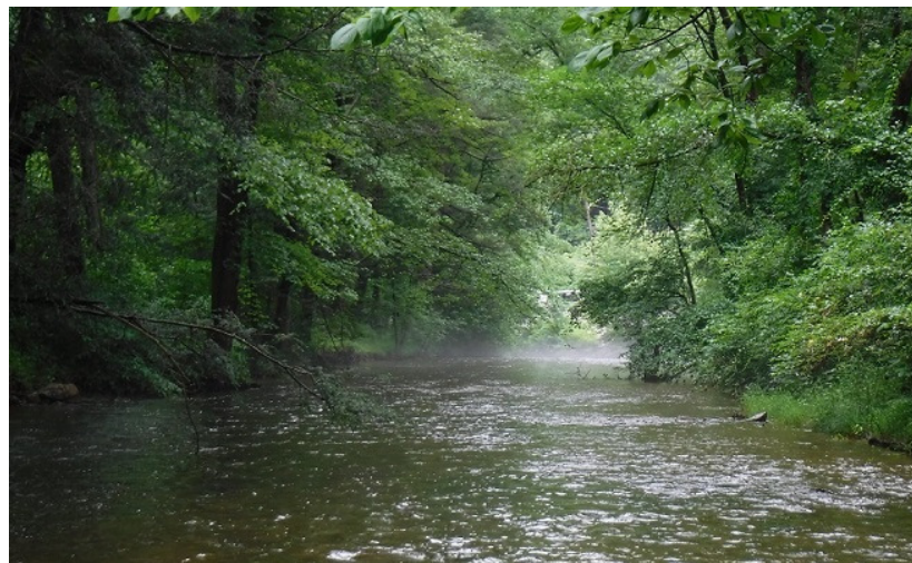
Mountain Creek. June 2018

Although local streams have been bank full and cold lately, we've got summer weather at hand and the weather folks are calling for days of heat. Although not a nice time to be outside, the days are long and the last hour before dark is magic. Rather than staying indoors all day, do your mind and body a favor and get away from paperwork, TV, computer and phone screens...and get back outside. After dinner, wait till about 7:45 or so and head out. If walking isn't your style, drive around the Cumberland Valley and note all the deer moving out into the fields. Birding and wildlife watching bring great rewards in the magic hour. This is a great time to walk along the Letort rail trail or the new trail in Shippensburg. Your dog would love to join you. It's a good way to keep an eye on our local creeks too. There's even time for a few casts. So remember the old ditty about mad dogs and Englishmen, wait till evening, get off the couch, and get outside during the magic hour.