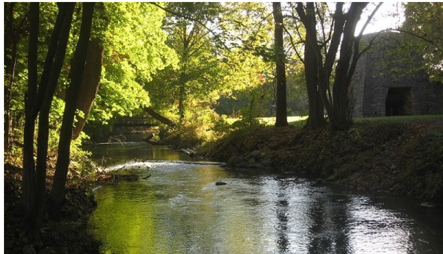
The Run.