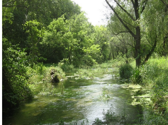
Letort.