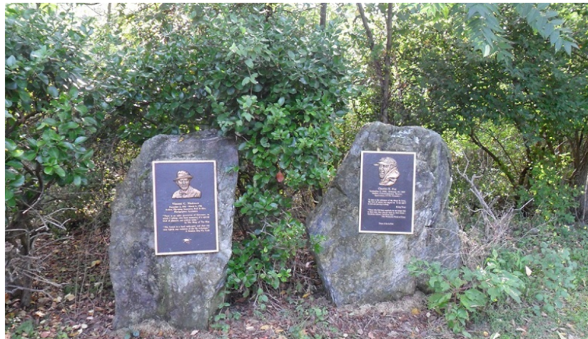
Vince's Meadow.

The term "marathon not a sprint" has become a cliché. Nevertheless a running analogy can often fit CVTU's activities: they are ongoing, sometimes exhausting, motivational, and speed up and slow down at different times. Sometimes in a run you have a fast lap, often the last one, as you hope to do your best, break a new speed record, or meet a qualifying time. For our chapter, June is the fast lap. There is so much going on and so many worthwhile events unfolding that we sometimes feel like we are in the fastest part of our annual, twelve month run. So let's pick up the pace, pour some more water down our throats, and reach deep down for some extra effort this month. June is our fast lap. Let's keep stepping.