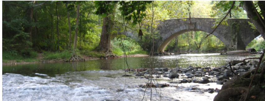
Yellow Breeches.