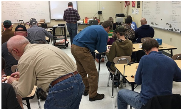
Fly Tying Course