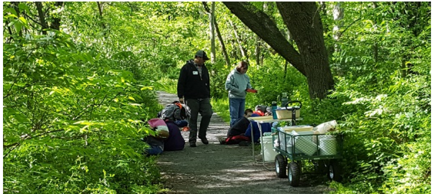
Students learn about Letort.