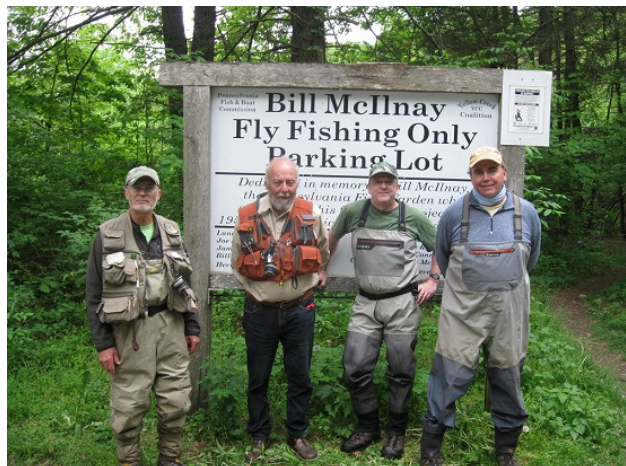
CVTU Members at Yellow Creek.