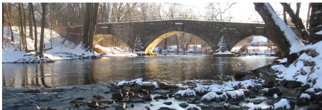
Yellow Breeches

Along with the fly tying contest, CVTU in association with the Chesapeake Council of the International Federation of Fly Fishers, will also host a 5-weight fly casting competition. This contest is also open to all with categories for men, women and youth along with an Open Division for more experienced guides, instructors and professionals. Competitors will be challenged by both accuracy and distance tasks with winners determined by the highest combined score. All winning competitors will receive plaques along with merchandise prizes. The entrance fee is $25 for pre-registration, postmarked by June 12, 2015, or you can sign up the day of the event for $30. Complete rules and registration forms will also be available on CVTU's website: www.pacvtu.org .