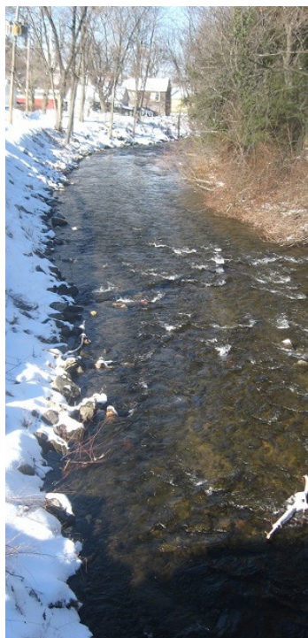
Mountain Creek

Submission of articles and suggestions for this newsletter are encouraged and may be sent to dweavflyart@yahoo.com , or you can call me at 338-1952 . The deadline for the next issue is the 22nd of each month. The primary distribution of Tight Lines is currently via Mail Chimp email system. Tight Lines will be mailed by request only.