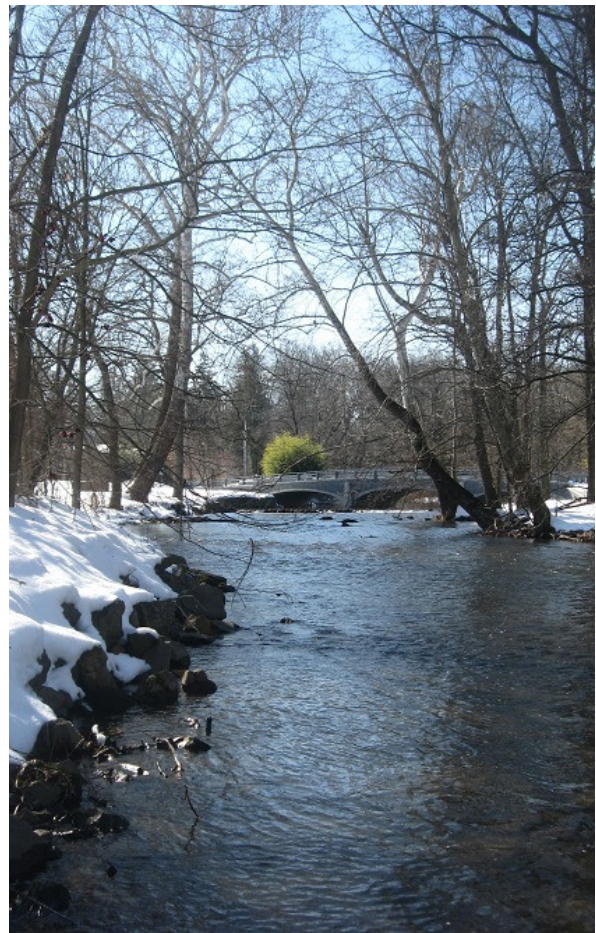
Yellow Breeches, Photo Courtesy: D. Weaver