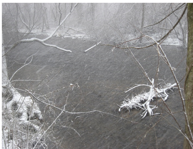
Breeches Snowstorm

Also, if you are interested in joining the Limestoner committee, we could really use your help. The Limestoner Banquet is CVTU's biggest event of the year and our main source of funding for all of the great events and projects that CVTU puts together on an annual basis. If you think you could lend some of your time (anything helps), please feel free to contact me. My contact information is available on the website or in Tight Lines under, Board of Directors. I look forward to seeing all of you in March for the 2017 Limestoner!