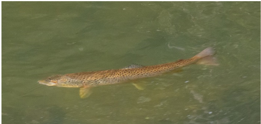
Penns Creek Brown