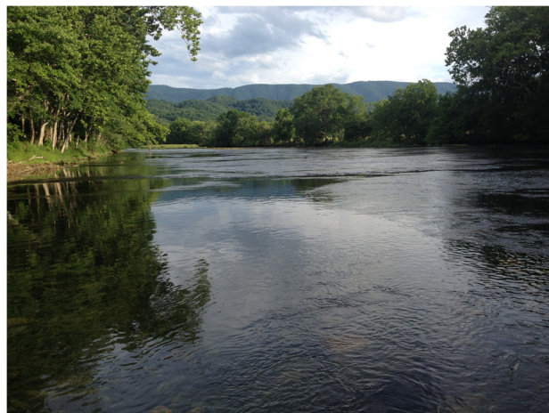
South Holston River.