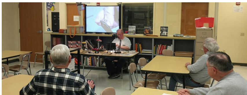
CVTU Winter Fly Tying Class.