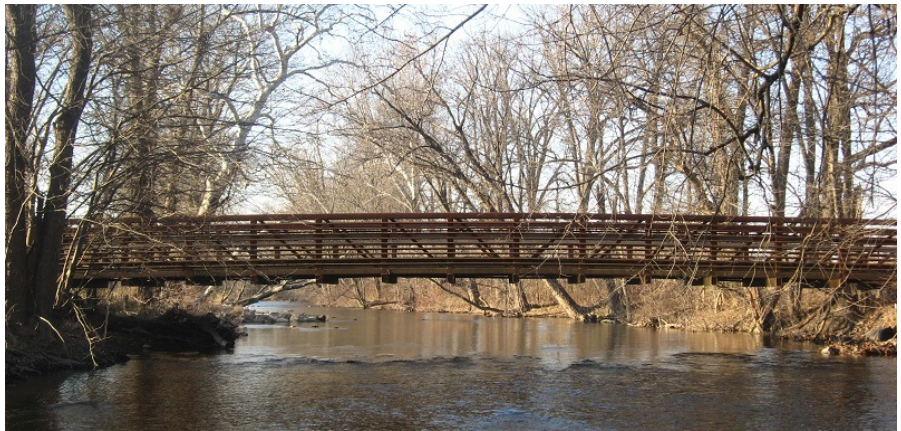
"Yellow Breeches"

~ CVTU will be holding the 22nd annual Rivers Conservation and Fly Fishing Youth Camp on June 19-24, 2016, at the Allenberry Resort in Boiling Springs. The camp is for boys and girls aged 14 to 17. The early application period is now open through March 31, 2016. For more information please see page 5. Clark Hall