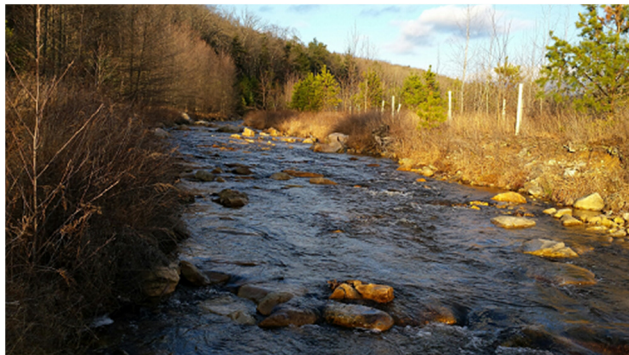
"Conococheague"